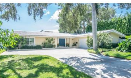
3896 42nd Ave N 3 bed | 2 bath | 2.538 SF Last listed at $895,000

4400 39th Street S 3 bed | 3 bath | 2,200 SF Last listed at $735,000