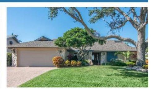
4389 45th St S 4 bed | 3/1 bath | 3,406 SF Last listed at $995,000